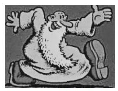
Trudging the Happy Road of Step Ten

Although it may take a while to get these convenient directions down pat, they are very worthwhile, because, once learned, we can complete most of this process, keeping us on a spiritual beam, in only a few seconds as we trudge through the pitfalls of each day.